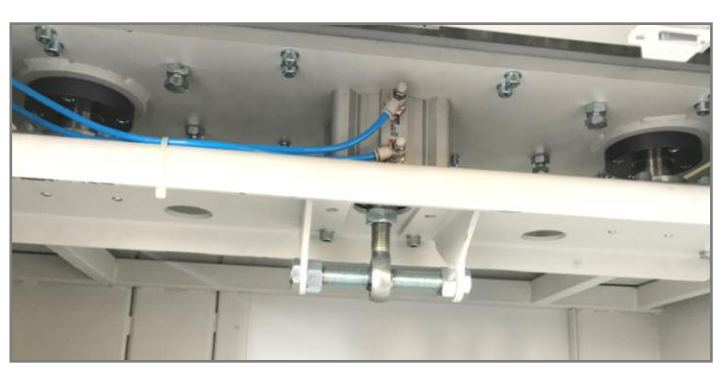
Magnets be activated upper position and deactivated lower position

With the Quick Fix connector the edge rounding disc can be changed against a deburring disc withtin seconds (Option).