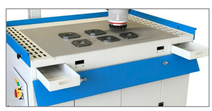
Dust draw right and left